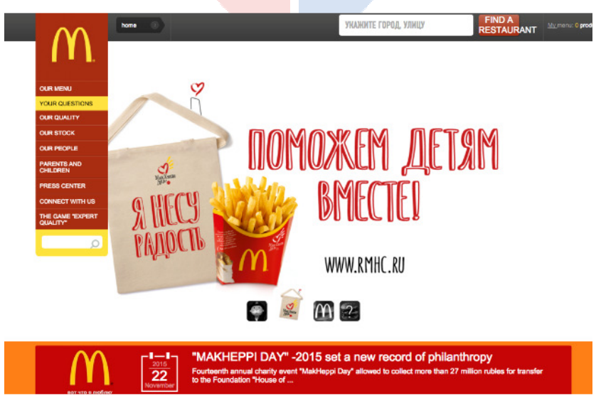
Figure 7 Low PDI country website, placing emphasis on customers of product

Figure 6 Burger King United States homepage