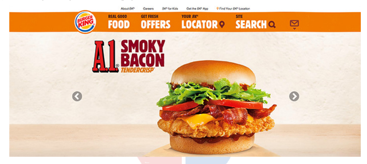
Figure 6 Burger King United States homepage