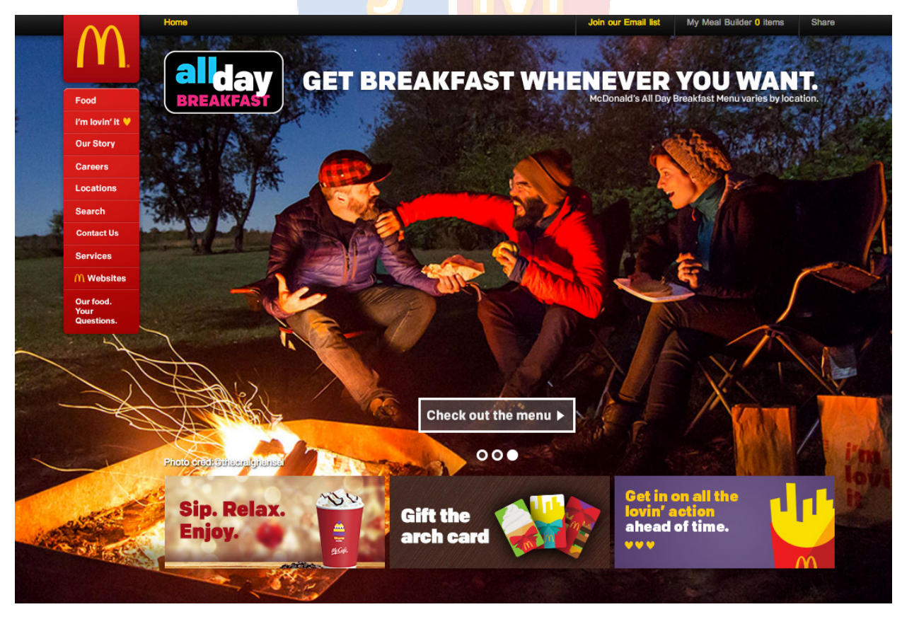
Figure 9 Low UA country website, large color variation with maximal content and choices

Figure 8 High PDI and High UA country website, placing emphasis on company brand, using minimal color variation