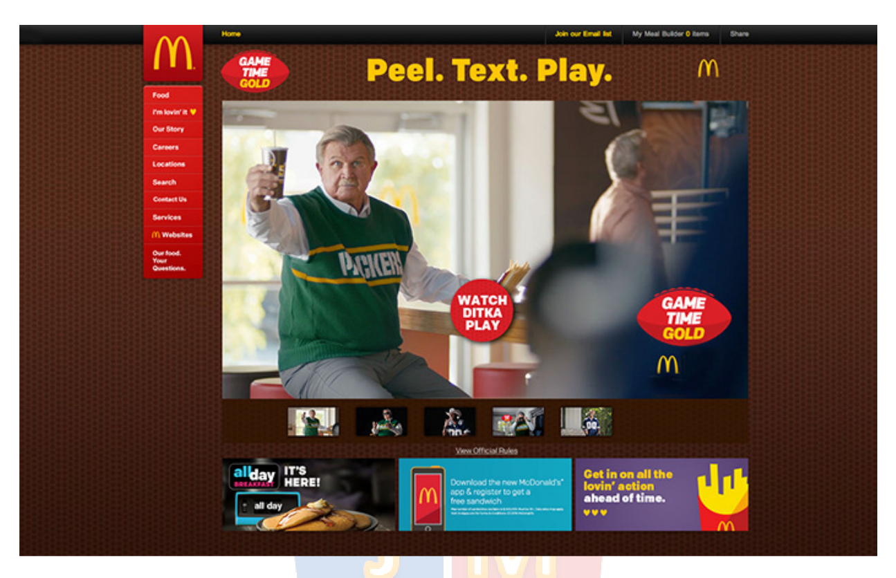
Figure 3 McDonald's United States homepage