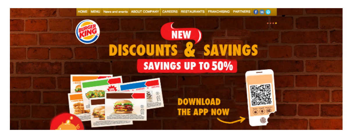
Figure 5 Burger King Russia homepage