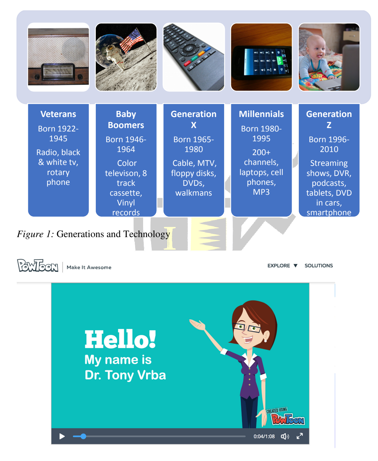
Figure 2: Anime Instructor Introduction